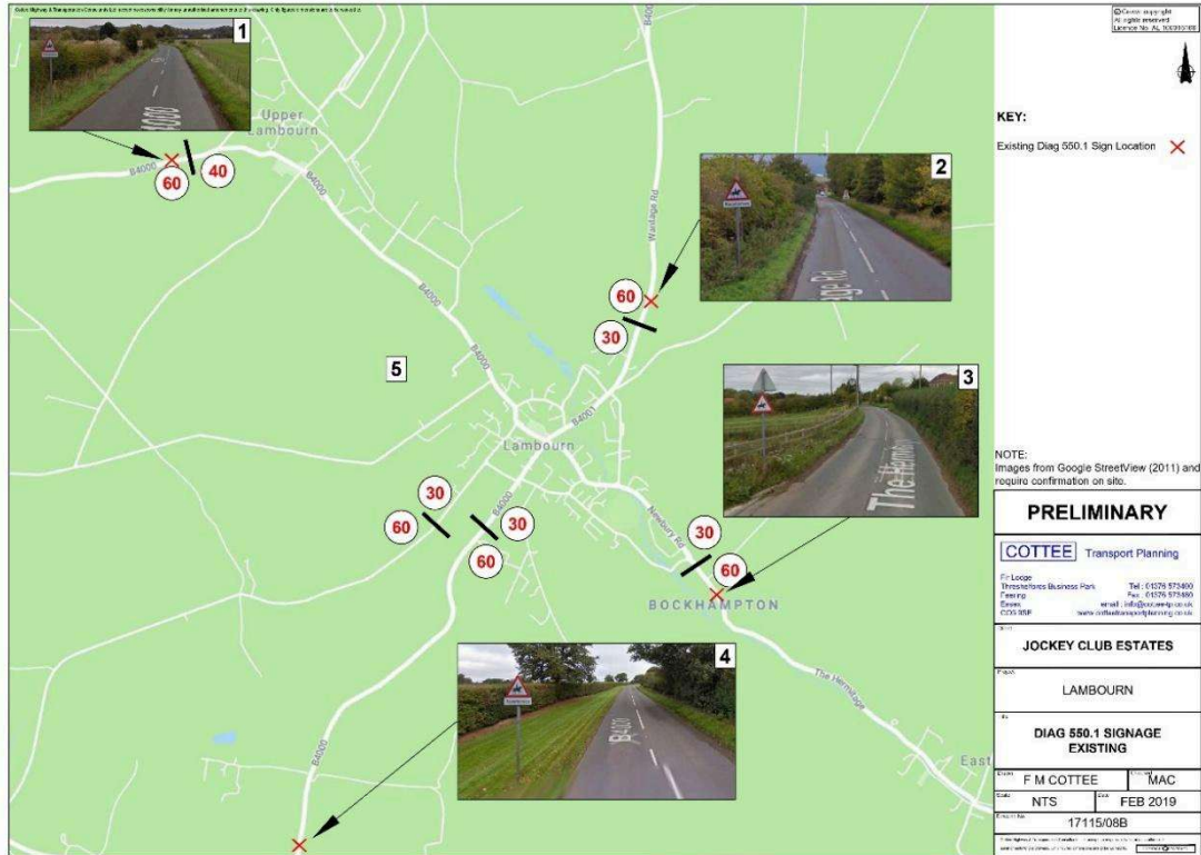
Figure 32. Map of Speed Limits near Common Racehorse Crossings