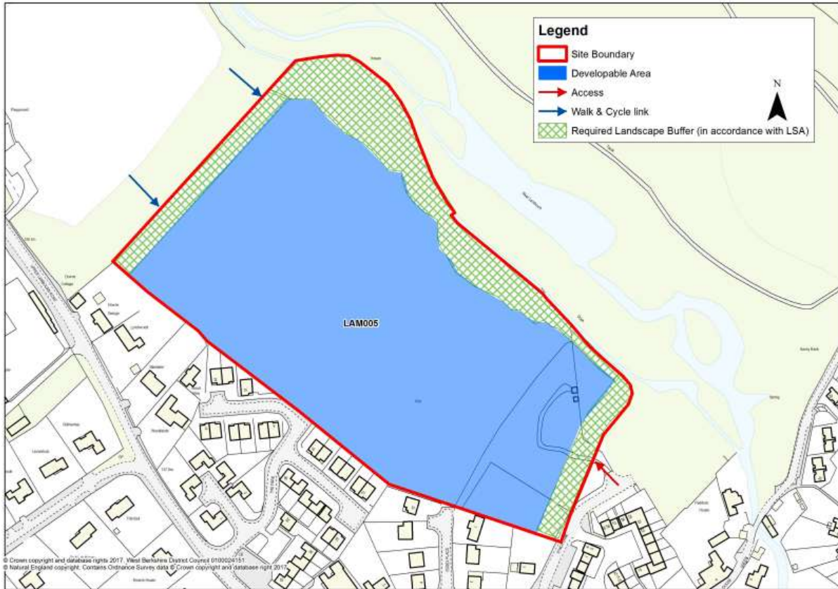
Figure 1. Development Plan Extract Showing LAM005: Land Adjoining Lynch Lane

1.1.5. Similarly, the Housing Site Allocations DPD contains Housing Site Policy 20: Land at Newbury Road, Lambourn (site reference LAM015) which consists of a development that is located to the eastern end of the built-up area of Lambourn and is projected to provide approximately 5 dwellings (see Figure 2 below).