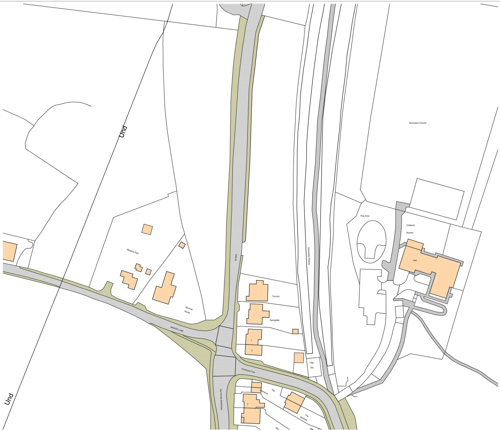
As Existing Block Plan