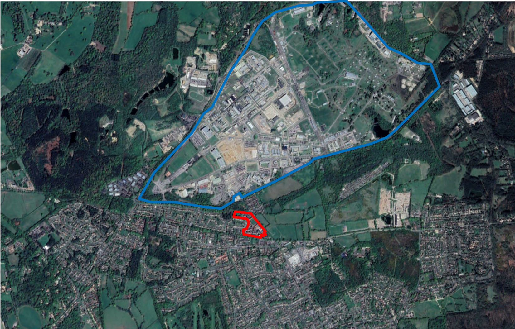
AWE shown edged blue. Boundary Hall appeal site edged red.