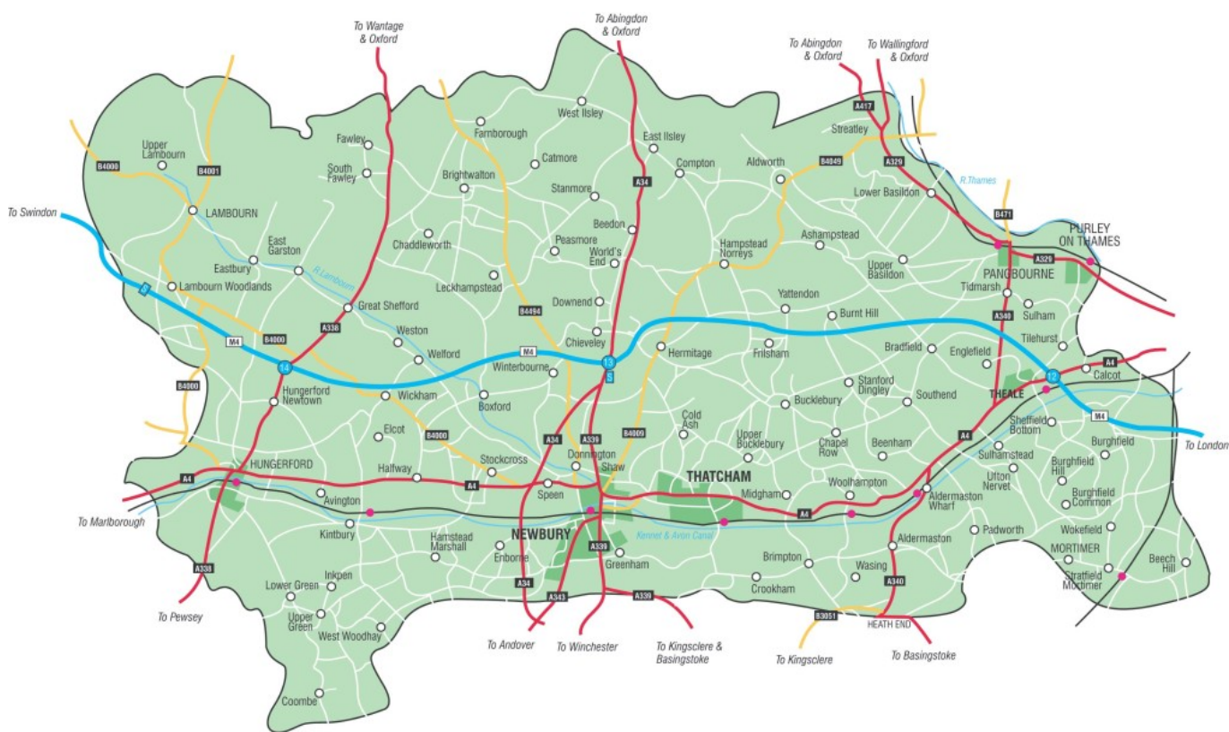
Figure 1.1 West Berkshire

1.13 Employment provision is diverse. West Berkshire has a strong industrial base, characterised by new technology industries with a strong service sector and several manufacturing and distribution firms. The areas that have the highest concentrations of employment are Newbury Town Centre and the industrial areas and business parks in the east of Newbury, the business parks at Theale, Colthrop industrial area east of Thatcham and the Atomic Weapons Establishments at Aldermaston and Burghfield.