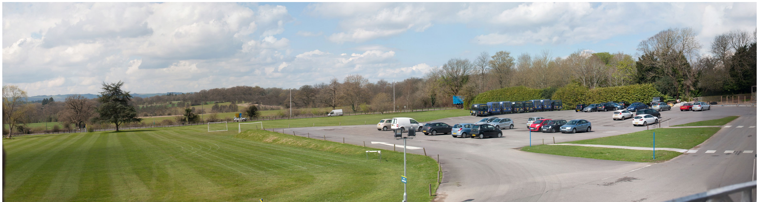
Viewpoint 8b: 15 years after planting from Sandelford Priory, First floor window from St Gabriel's School looking west towards the site. No new houses in the proposed development visible.