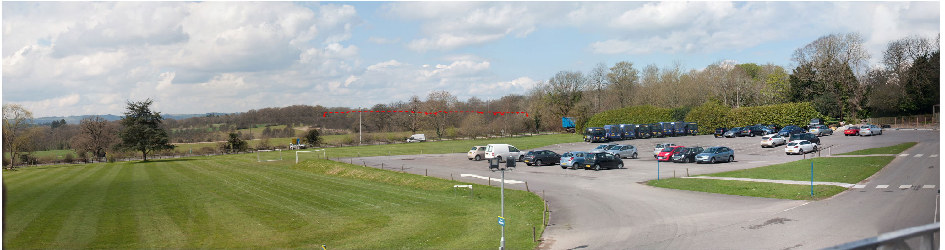
Viewpoint 8b: Wire frame after 15 years of planting with redline indicating the location of the proposed houses behind the existing and proposed vegetation and woodland. No new houses in the proposed development visible.