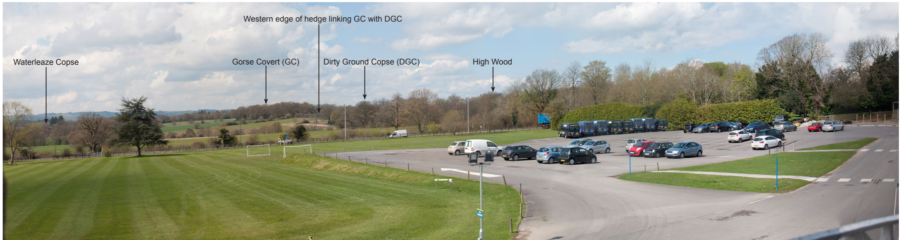
Viewpoint 8b: Existing view from Sandelford Priory, First floor window from St Gabriel's School looking west towards the site.