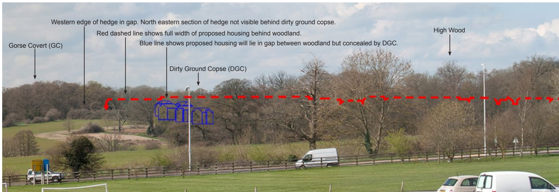
Viewpoint 8b: Zoom of above (300%). No new houses in the proposed development visible.