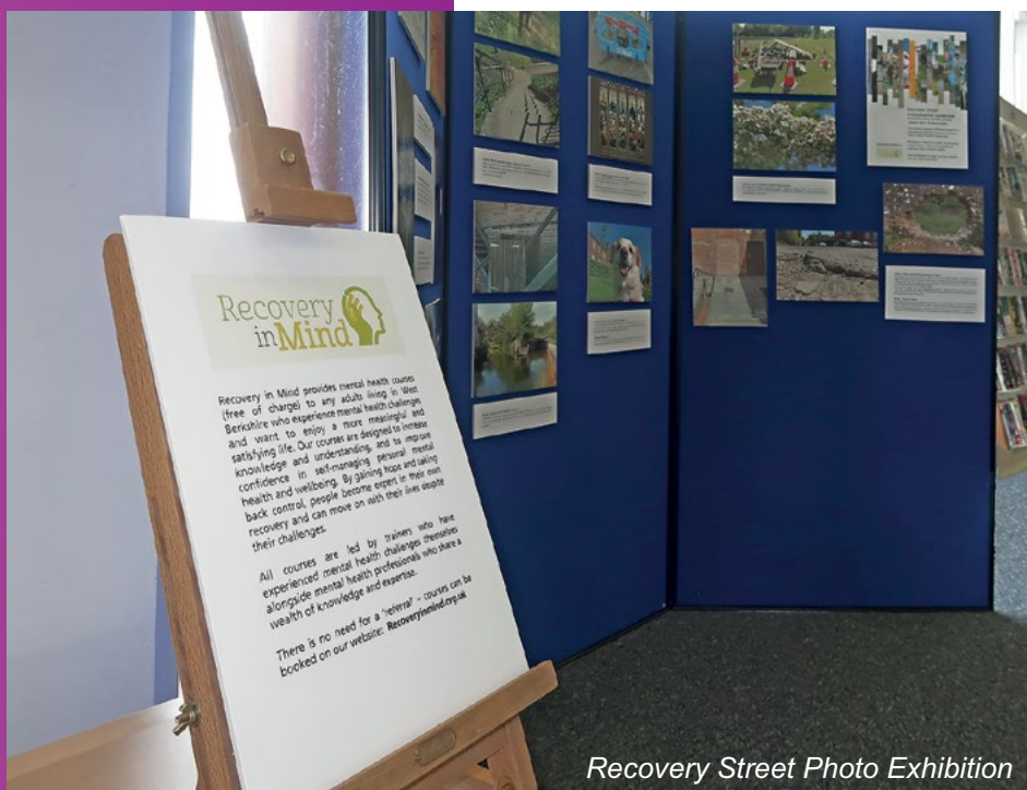
Recovery Street Photo Exhibition

For more information go to www.recoveryinmind2016.com/free-courses