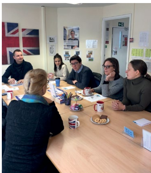
Learning English with the Berkshire School of English