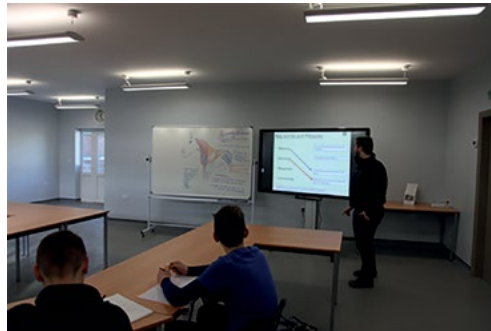
Hero's new education hub

dan@heroscharity.org or go to www.heroscharity.org/