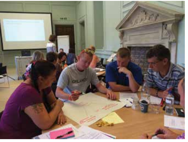
Getting involved in the 2015 Tutor Forum

Contact the community learning team to book a place.