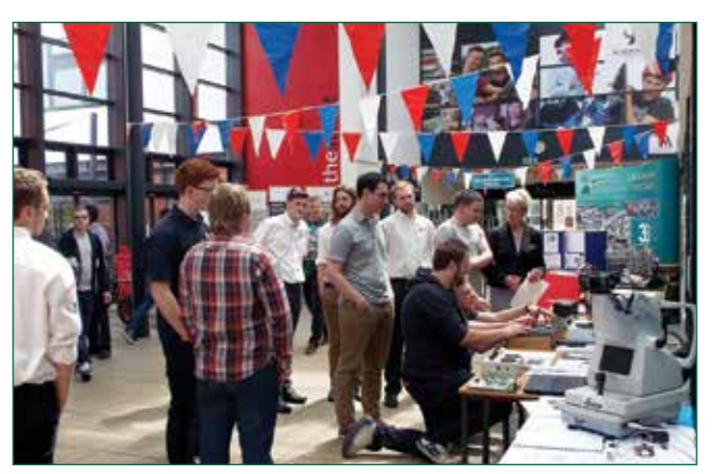
Engineering students put on exhibition at Newbury College