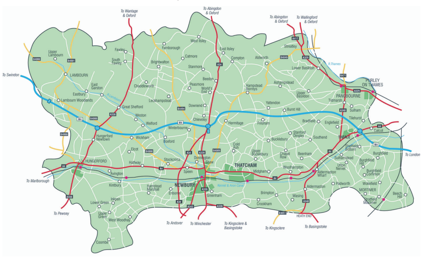
Map 1.1 West Berkshire